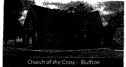
Church of the Cross - Bluffton