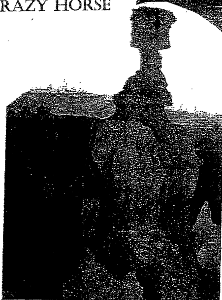
Bryce Canyon National Park