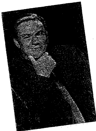
Jim Ed Brown